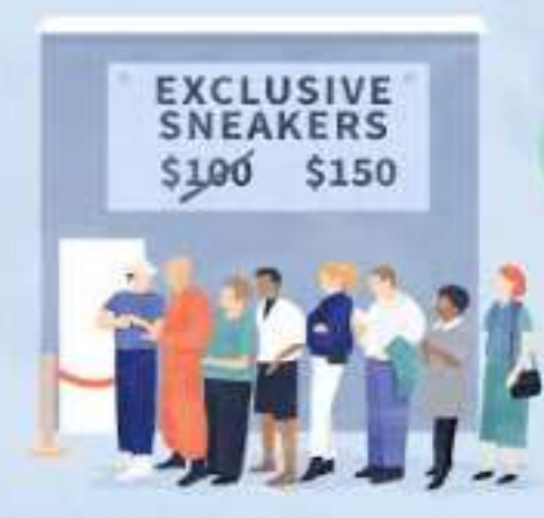
When demand for goods/service exceeds production capacity.