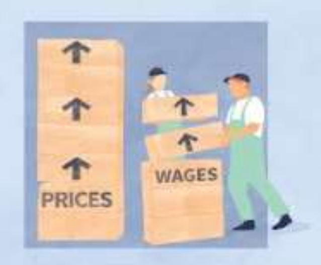
When prices rise, wages rise too, in order to maintain living costs.