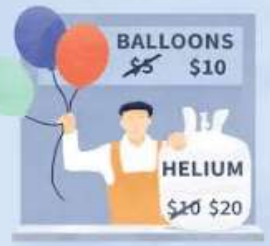
When production costs increase prices.